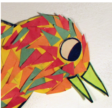
animation still, Old School New School